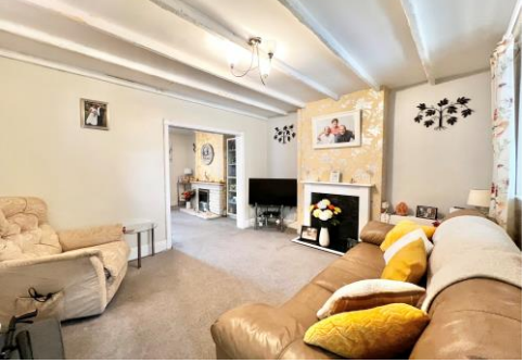
'A charming end of terrace cottage that boasts a large garage and also a garden that measure approximately 175ft in length!'

This two bedroom end of terrace cottage is an ideal purchase for a variety of buyers and is presented in tidy order and could be moved into with very little fuss! The accommodation comprises entrance porch, perfect for shoes, boots and coats and this then leads into a cosy lounge/dining rom with stairs rising to the first floor. The kitchen/breakfast room is across the rear of the property with a door into the shower room which is on the ground floor. Upstairs there are two large double bedrooms. GCH and double glazing. Externally the front of the property provides parking for one vehicle and there is a shared vehicular access to the rear serving the terrace which leads to a larger than average garage. There is a small enclosed courtyard area outside of the back door and beyond the garage is a lengthy lawn rear garden measuring approx. 175ft in length.